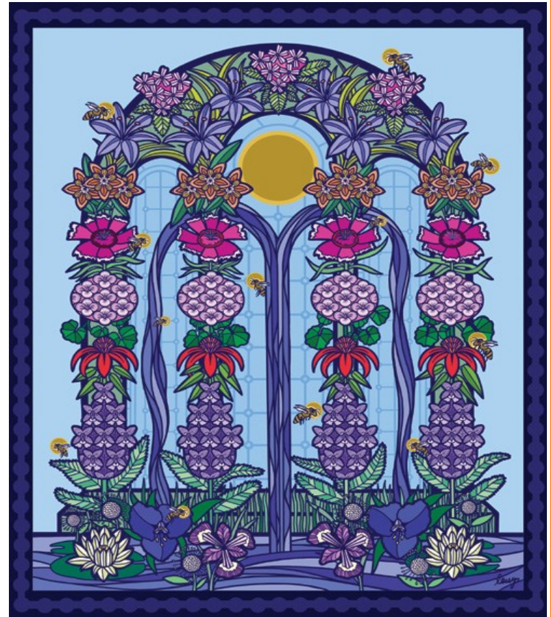
“Full Life in the Emptiest of Places” from A Sanctified Art