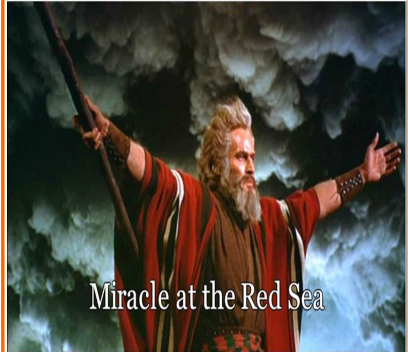
Miracle at the Red Sea